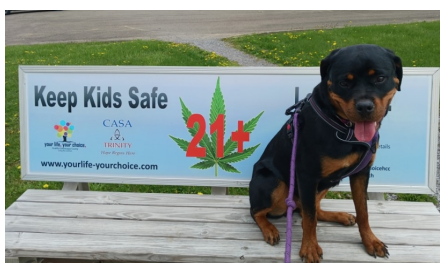
Cattaraugus Prevention Pup on one of our bench boards in Olean, NY.