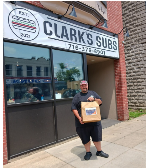
Clark's Subs, Pizza Box Campaign