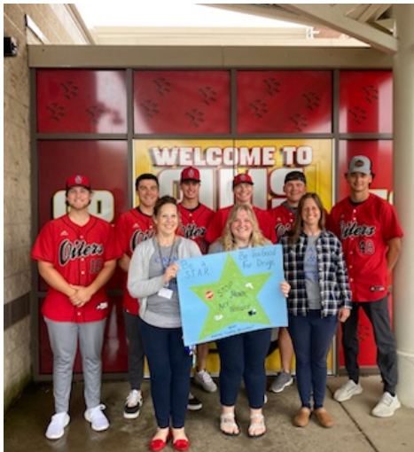
Oilers Kids Day, Olean, NY