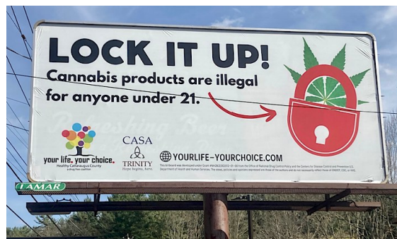
Billboard in Olean, NY